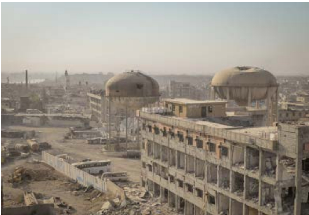
A view of part of the Al-Shifa complex in 2017

During the last phase of the conflict with ISIS, the group used the Al-Shifa hospital complex in West Mosul as its headquarters. The complex is located on the right (West) bank of the river Tigris adjacent to the Old City, where the final stages of the conflict took place. As documented elsewhere, 45 the damage sustained to West Mosul and the Old City in particular by the final offensive was immense. 46 This damage came primarily from the heavy use of explosive weapons including airstrikes, artillery and rocket barrages by forces allied with the Iraqi government, as well as the use of improvised explosive weapons by ISIS. One clearance operator working in the Old City area after the conflict informally estimated that around two fifths of the resulting unexploded ordnance and remnants to clear were from ISIS, and three fifths from liberating forces.