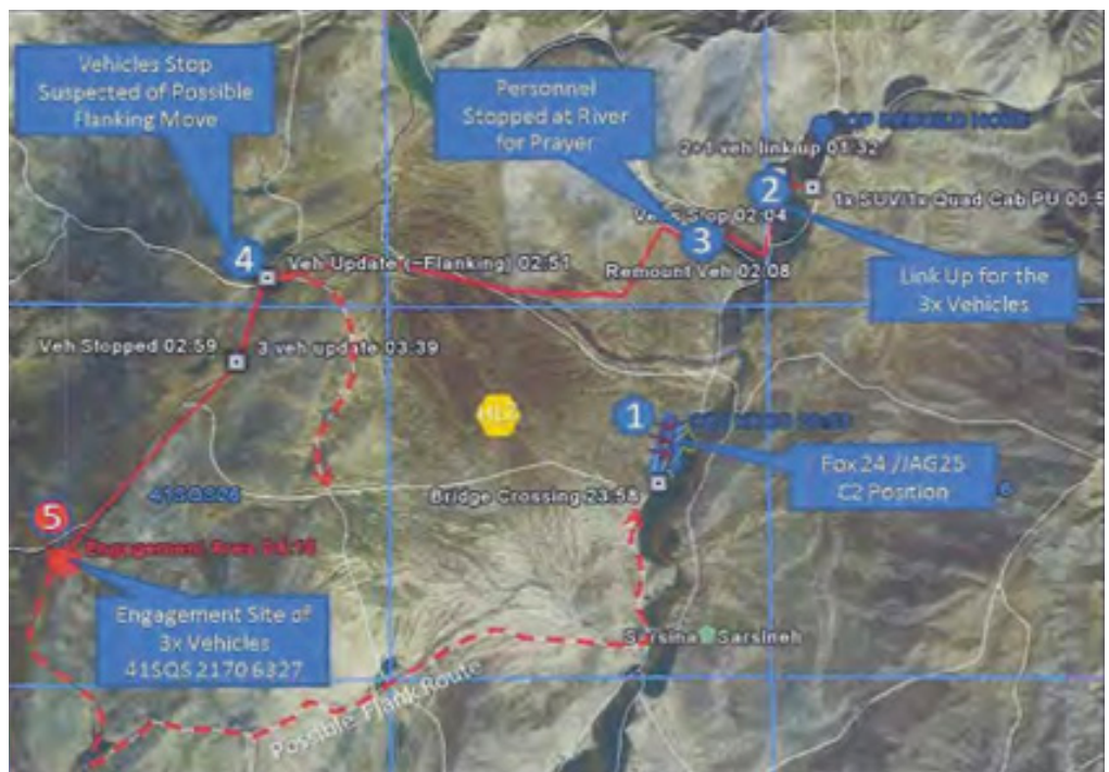
Figure 1: Map of the Vehicles' Journey Provided in the AR 15-6 Report

that the AC-130 release munitions between the vehicles and the ODA in order to disrupt their journey. Before this non-lethal course of action was completed, however, the AC-130 crew requested that a nearby MQ-1 Predator drone, callsign Kirk97, be re-tasked to the vehicles in order to train a second, more powerful, camera lens on the potential threat. The JTAC agreed with this course of action, and within minutes the Predator crew - which consisted of a pilot, a sensor operator, and a mission intelligence coordinator (MC) - 'had eyes' on the vehicles.