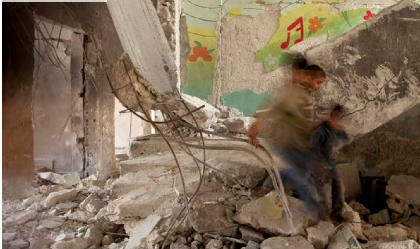
Aleppo, Syria February 9, 2013. Tarik Al Bab primary school closed and damaged by fighting.

These reflections were prepared from: a review of key documents and internal correspondence from the SSD consultation process; data on universalization; and informal conversations with some individuals centrally involved in the SSD's conception, agreement and subsequent efforts around it, including reflections provided at an informal meeting in Geneva to discuss these issues in June 2019. 2 Article 36 thanks all individuals for the insights used here, but takes responsibility for the content of this paper. This paper does not represent a comprehensive account of the SSD process, but is intended rather to provide some key reflections from Article 36's perspective and based on our work on this issue, from the point of view of looking ahead to future work.