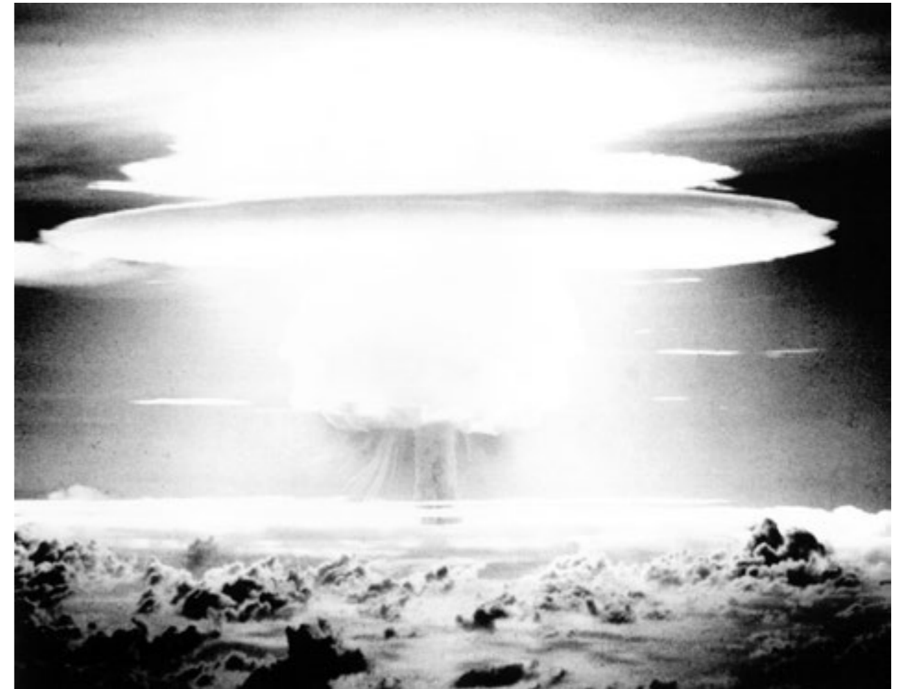
A 15-megaton thermonuclear explosion at Bikini Atoll in the Marshall Islands in 1954.

The Comprehensive Test Ban Treaty was adopted in 1996 but has not yet entered into force. As of February 2013, 158 states are parties to the treaty and 25 more are signatories, but have not yet ratified the treaty. The provisions of the treaty require a particular group of countries with nuclear reactors to ratify before it can enter into force. Of these, China, Egypt, Iran, Israel and the US have signed but not ratified and India, North Korea and Pakistan have not signed. The Comprehensive Test Ban Treaty Organisation exists to monitor compliance with the treaty around the world. The Soviet Union last tested nuclear weapons in 1990, the UK in 1991, the US in 1992, and China and France in 1996. The most recent known nuclear tests by India and Pakistan were in 1998. A test by North Korea in February 2013 was again met with widespread international condemnation, including from the United Nations Security Council.