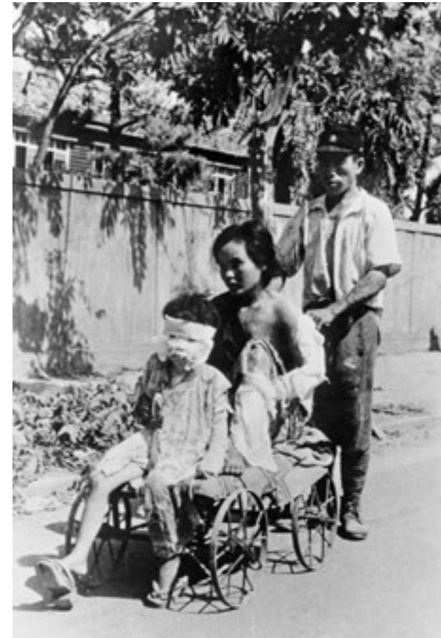
Survivors of the Hiroshima bomb who have received some medical care. 12 August 1945, Hiroshima, Japan.

In addition to the EMP, the ionized fireball has the ability to block radio and radar signals for seconds to minutes over an area tens of kilometres across. High frequency radio can be disrupted over hundreds of kilometres for minutes to hours under certain conditions.