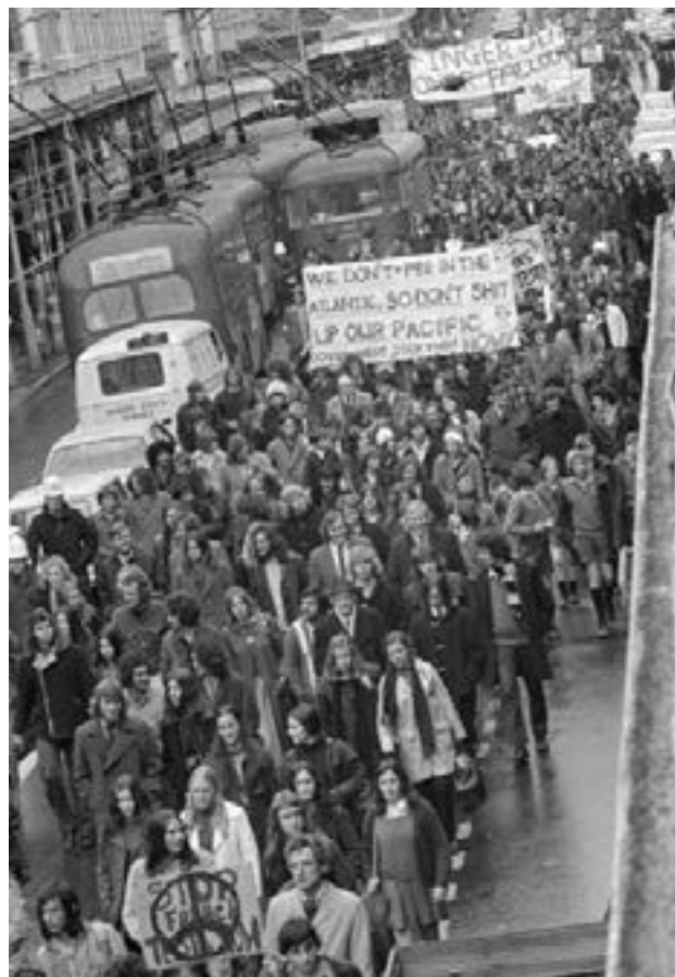
Protest march against French nuclear testing in the Pacific, Wellington, New Zealand, 1972.