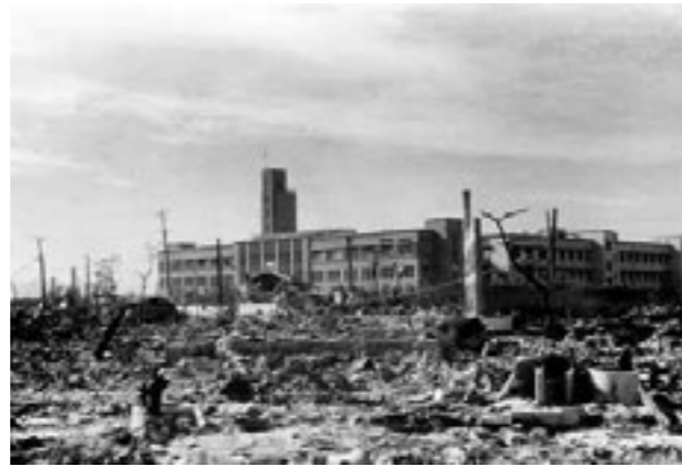
Hiroshima Red Cross Hospital.

Given the precarious situation of the 925 million people who are presently malnourished, even a small decline in available food and rise in prices will have devastating consequences. Famine on a major scale would lead to epidemics of infectious diseases. Massive population displacements, political tensions and conflict over scarce resources, and possibly a breakdown of social order should also be expected.