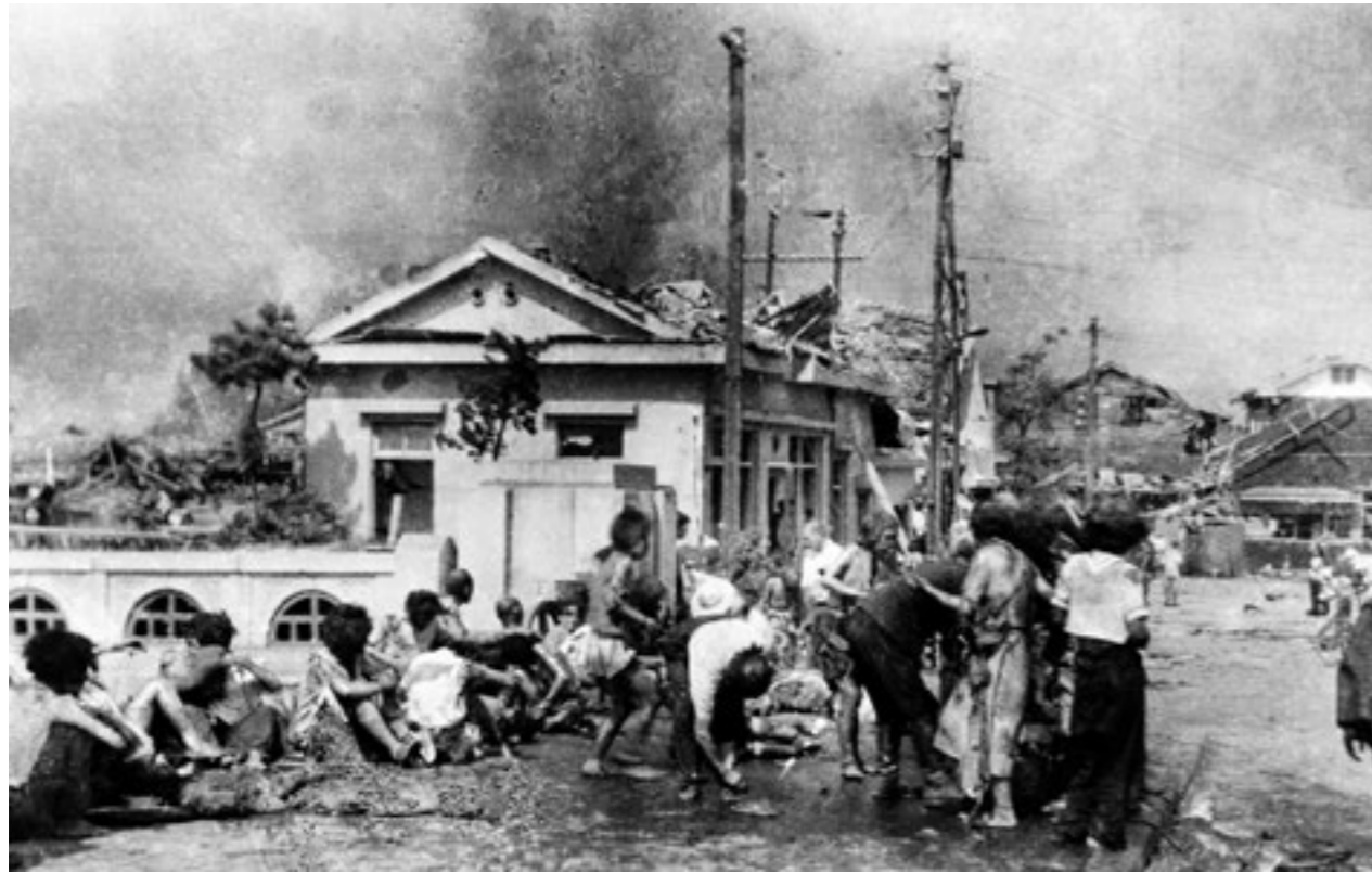
Injured civilians, having escaped the raging inferno, gathered on a pavement west of Miyuki-bashi about 11.00 am on 6 August 1945. 6 August 1945, Hiroshima, Japan.